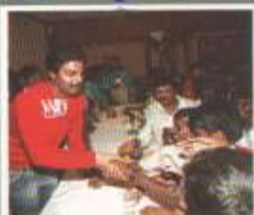
Nethrodaya on TOP priority list

Nethrodaya is supported by The Central and Tamilnadu Governments, the Judiciary and Security forces of India.