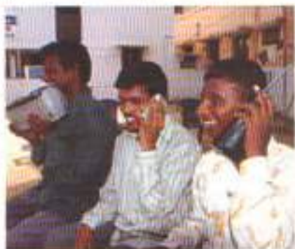
Sound - The greatest sense of the Blind

The students of Nethrodaya study by listening. Readers and volunteers come in the evenings to read out to students. Nethrodaya provides tapes and tape recorders to record reading sessions for future reference. There are also a large number of plug-points, and lesson tapes enabling students to study whenever they want.