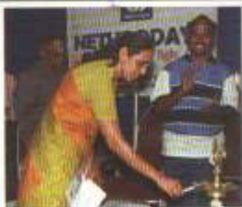
A politician who came in like a surgeon...