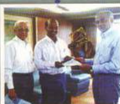
Wellington Corporate Foundation