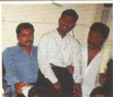
Sillunu oru visit