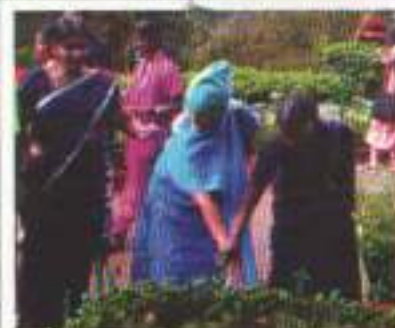
Trip to Ooty - 2005