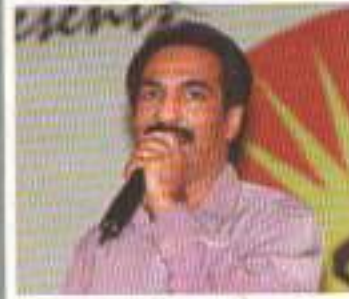
A new definition for Thiruonam