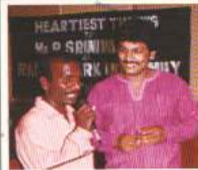
With singer Harish Ragavendra