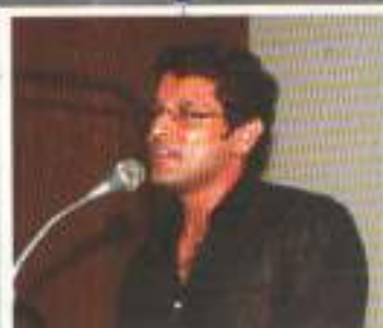
An Anniyan visits Nethrodaya