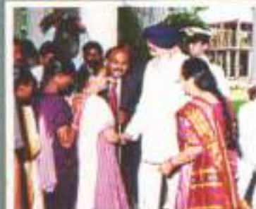
Jyothirbhavan invited to Raj Bhavan