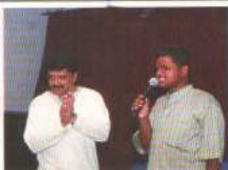
Of Singing and Music