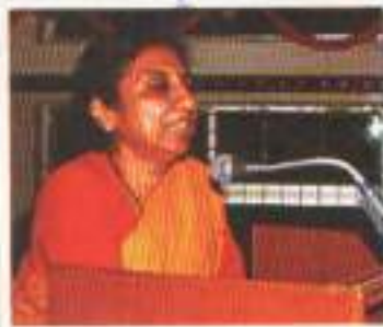
The long arm of the law...