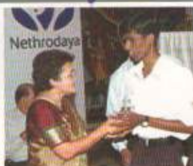
The woman behind "Agai"