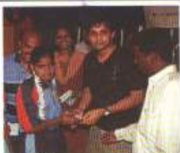
Enakku oru girlfriend venum ada...