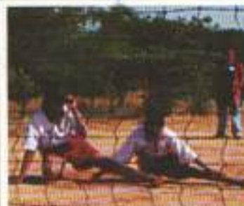
If its July its Volley Ball