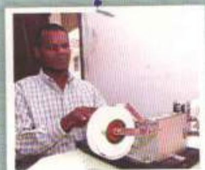
Beyond the 12th class why not Ph.d?

Nethrodaya has enabled a visually impaired person to operate the computer, work on specific software and access the internet, all with the support of "Jaws" software.