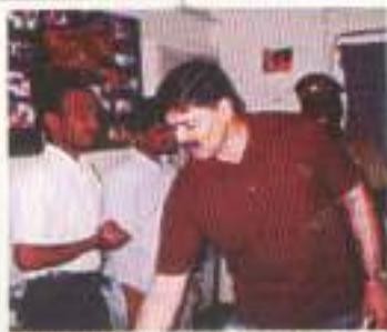
Man behind sensational Veerappan Episode