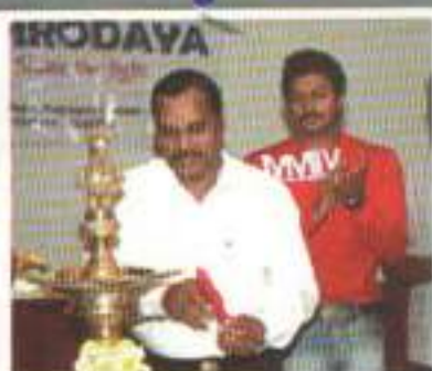
Working on a Sunday