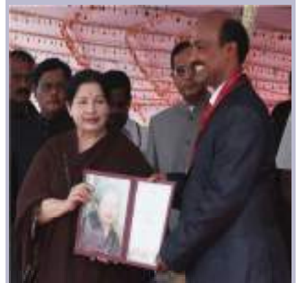
Best Institution Award - Nethrodaya