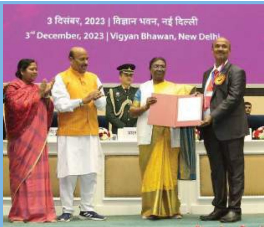
National Award from Hon'ble President of India