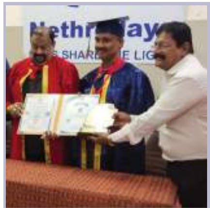
Doctorate in Social Service