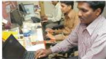
The photo shows people with visual impairment working at a computer in Chennai.

Nethrodaya, a social service institution based in Chennai, has lodged a complaint with the Chief Commissioner for Persons with Disabilities (CCPWD) in New Delhi over the "brutally insensitive and hostile" remarks made by the Commissioner of Chennai and the Director of the Tamil Nadu Electricity Board (TANGEDCO).