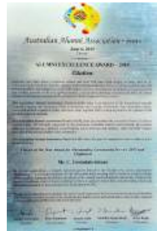
Citizen of the Year Award