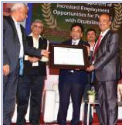
Helen Keller Award