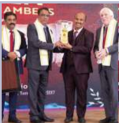
Lincoln Global Leadership Award 2024