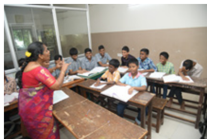
Higher Secondary School