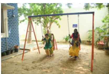
Park and Recreation