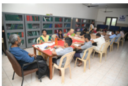
Digital audio and Library