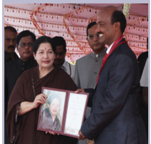
Best Institution Award - Nethrodaya