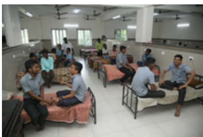
Boarding - Men