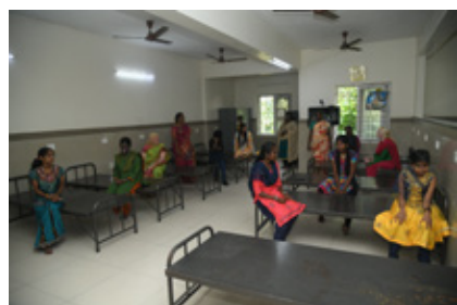
Boarding - Women